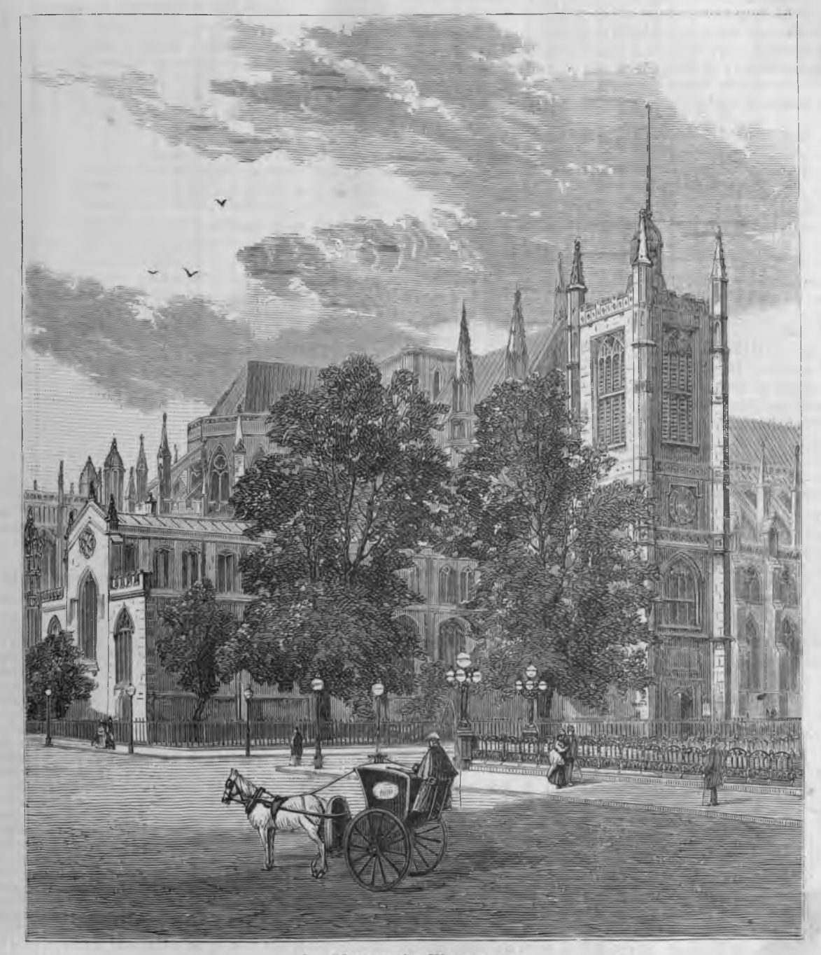
ST. MARGARET'S, WESTMINSTER.

the best, and, as in duty bound, for which I shall be forgiven The bell now known as the "third" was once the "treble,"