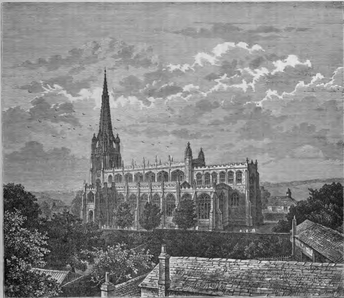
ST. MARY THE VIRGIN, SAFFRON WALDEN, ESSEX.

The lofty arcade of the Nave and the extreme lightness of the Church will strike everyone on entering it, and it must be