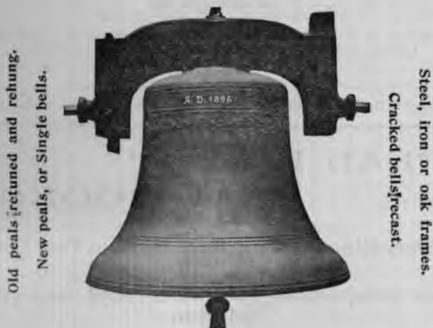
New Tenor Bell, St. Paul's Church, Bedford. Weight 29 Cwts.

Also the "ALEXANDRA" ring of ten bells of the Imperial Institute, London.