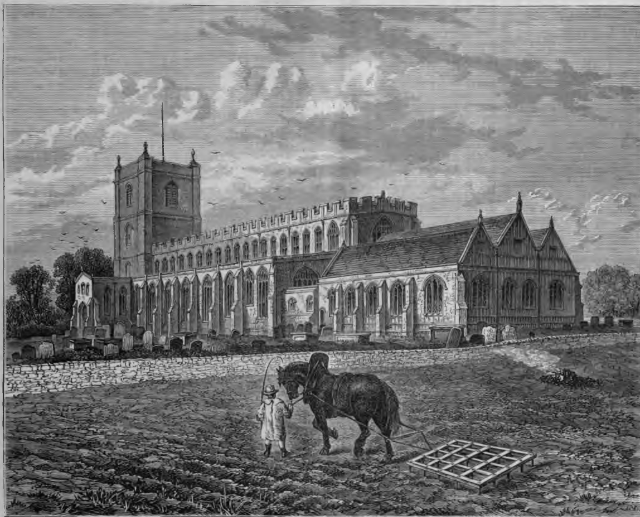
HOLY TRINITY, LONG MELFORD, SUFFOLK.

In a niche in the North wall is a curious carving of the Adoration of the Magi, which is 600 years old. The Church contains many handsome monuments of the Martyn, Clopton,