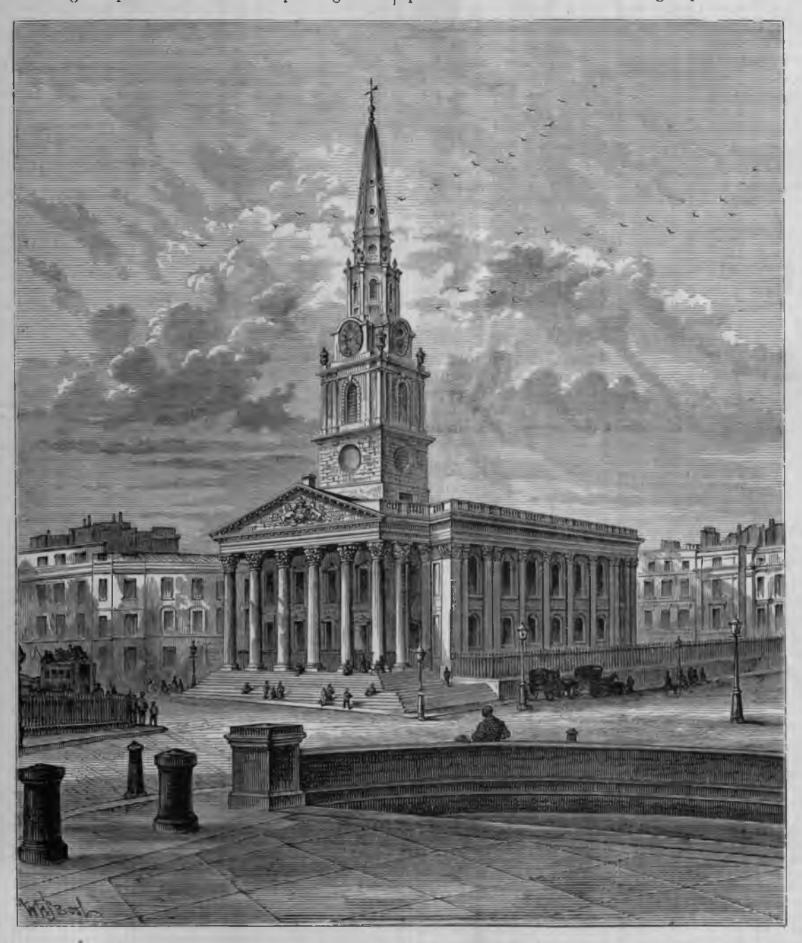
St. MARTIN-IN-THE-FIELDS, LONDON.

does in Trafalgar Square. To most campanologists it spiritual wants of the settlement grouped about the Abbey at