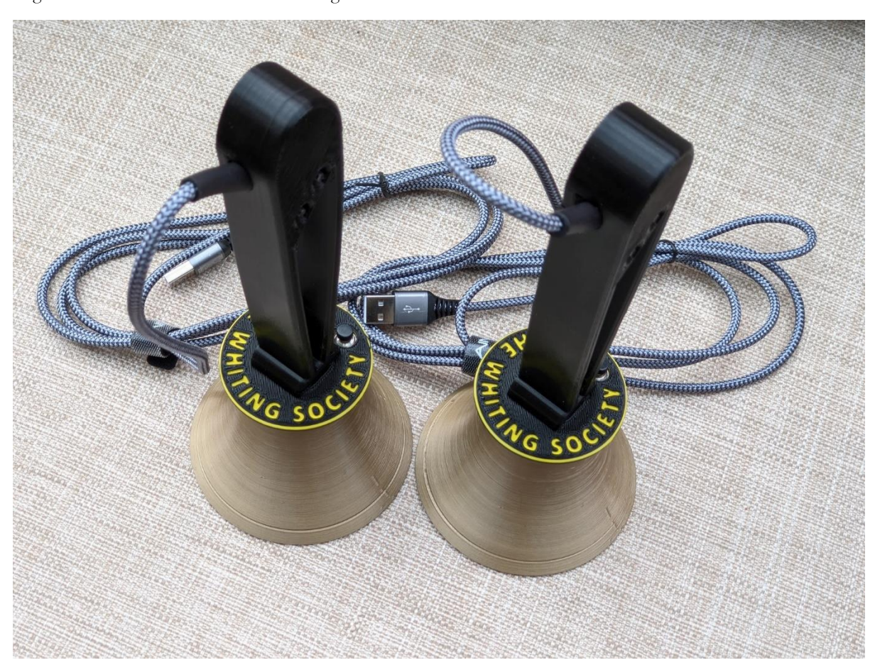
Figure 2 – A pair of eBells sponsored by The Whiting Society

ART and the CCCBR launched an initiative to subsidise the purchase of eBells for ringers under the age of 25 (bringing the price including P&P down from £97 a pair to £25 a pair). Generous donations funding the scheme were received from The Whiting Society, the eBells partnership and a number of individual donors. 37 younger ringers have benefitted at the time of writing.