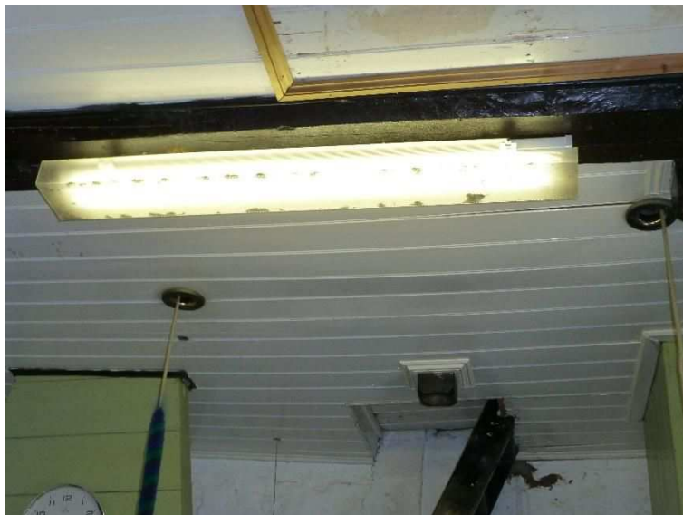
The picture above shows a typical strip light with diffuser, now with some debris building up.

Shading – The light must be diffuse; depending on the source, diffusers may be required. Many modern sources are much more intense and directional than traditional bulbs so care is required when installing new fittings at the same location as a previous lamp. The style of shade also requires careful selection. If dust, insects, spiders or other debris can easily collect in a shade or diffuser, this will soon reduce the light efficiency and potentially become a fire hazard. Ringers should not be expected to clean out lamp shades, at frequent intervals.