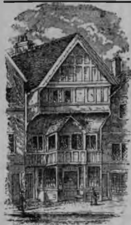
Ye Olde House, A.D. 1730.