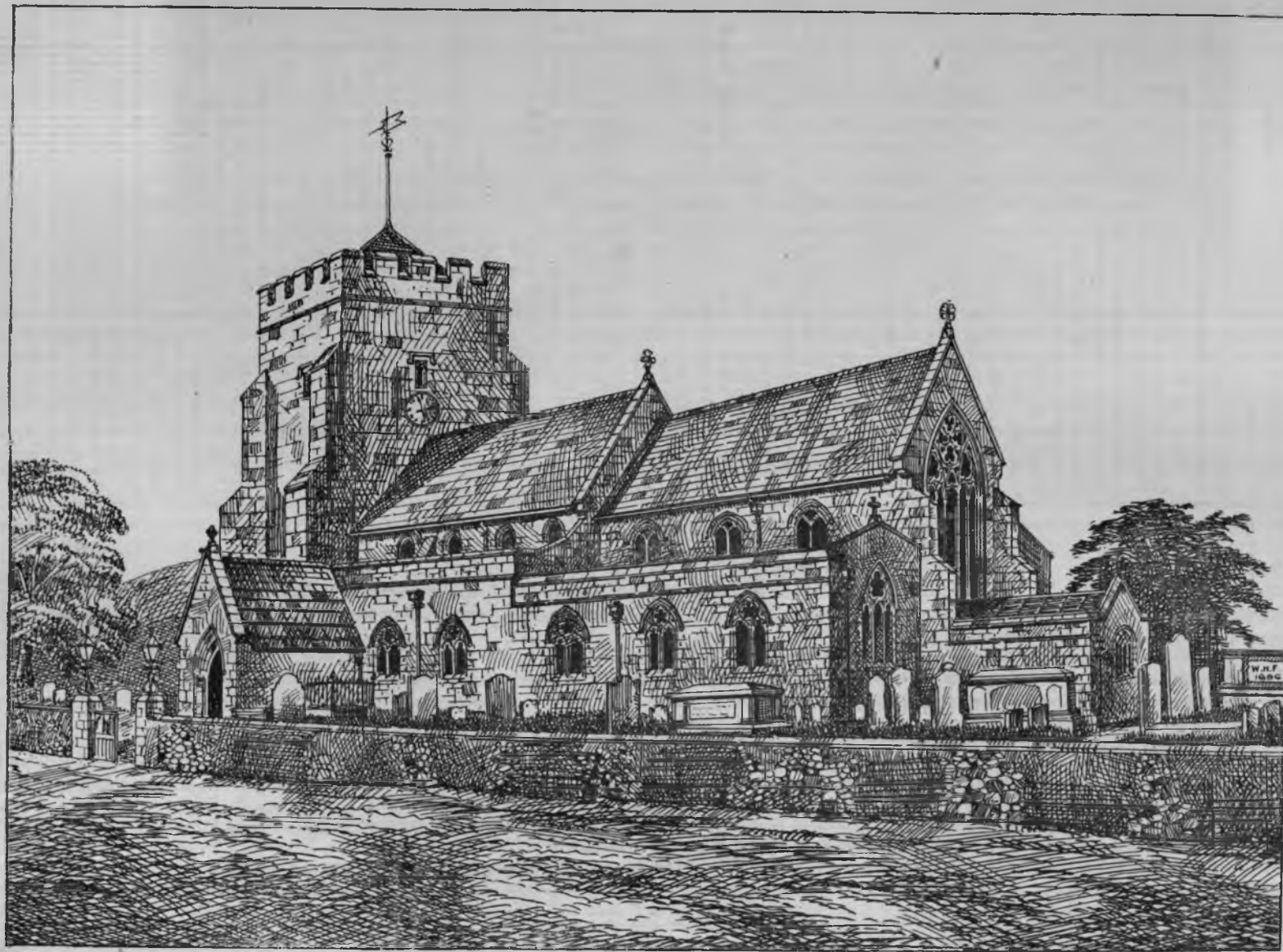
Specially drawn and engraved for this Journal.