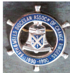
Silver and enamel