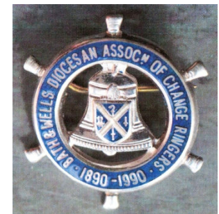
Silver gilt and enamel