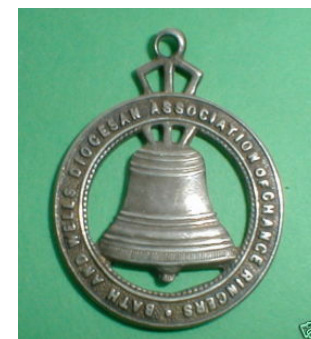
This example is hallmarked for Birmingham 1921

'Badges, Dies and Tools £8 18 0' Bath and Wells Diocesan Association annual report for 1915